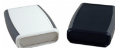
Light Grey or Black Enclosure Color